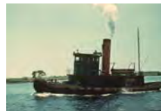
Ionian SL_01312 Quantity___