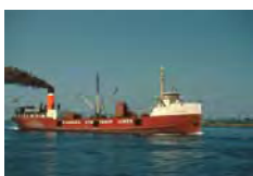
City of Kingston SL_03712 Quantity___