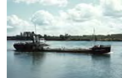
Coastal Cascades SL_06881 Quantity___