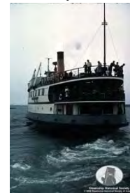
Nobska (Woods Hole, MA) SL_23061 Quantity___

Total Prints Requested _____ X $12.00 each print = $ _____ Postage & Handling (U.S. $7.00/International $15.00) = $ _____ TOTAL = $ _____