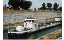
Coastal Cliff SL_07592 Quantity___