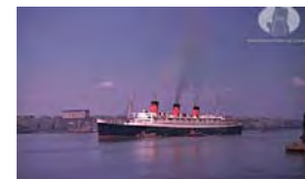
Queen Mary (Cunard Line) NY, NY SL_00844 Quantity___