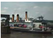
Pittsburgh & Washington (Delaware River ferries) SL_03642 Quantity___