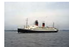
Ile de France (French Line) NY Harbor SL_07360 Quantity___