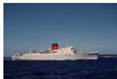
Ocean Monarch (Furness Bermuda Line) SL_05326 Quantity___