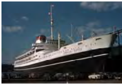
Andrea Doria (North River Pier, NY) SL_07187 Quantity___