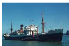
City of Madras SL_01097 Quantity___