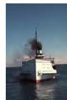
The Straits of Mackinac (Michigan State ferries) SL_09762 Quantity___