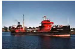
Imperial London St. Lawrence SL_06896 Quantity___