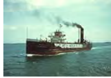
Britamolene (Furness Shipping Co. Ltd) SL_01600 Quantity___