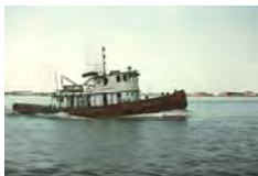
Girard Point SL_01201 Quantity___