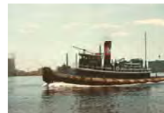
Jupiter SL_01197 Quantity___