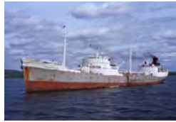
Prometheus Hudson River SL_07707 Quantity___