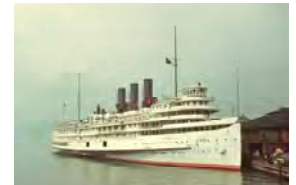
Greater Detroit (Detroit, MI) SL_01738 Quantity___