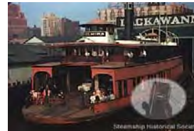
Elmira SL_01070 Quantity___