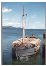
Comte Charlevoix (La Malbaie, PQ) SL_02847 Quantity___