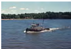
Corps of Engineers Tug SL_01123 Quantity___