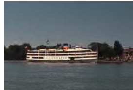
Columbia (Detroit River) SL_09017 Quantity___