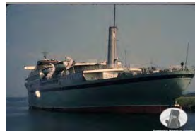
Aquarama (Muskegon, MI) SL_19920 Quantity___