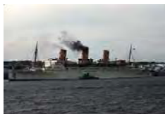
Empress of Scotland (Canadian Pacific Steamships) SL_07290 Quantity___