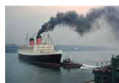
Queen Elizabeth (Cunard Line) North River NYC SL_10832 Quantity___