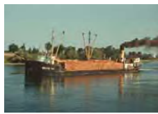
Shelter Bay (St. Lawrence River) SL_01460 Quantity___