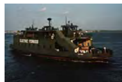
The Tides (NY Harbor ferry) SL_06852 Quantity___