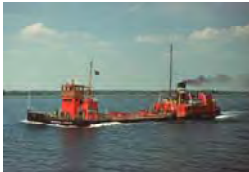
Imperial Lachine St. Lawrence SL_01475 Quantity___