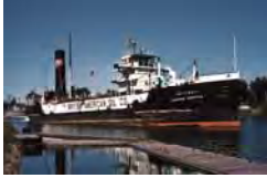
Britamoil (Gayport Shipping) SL_06897 Quantity___