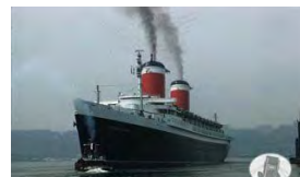
SS United States (United States Lines) Pier 86, NYC SL_17800 Quantity___