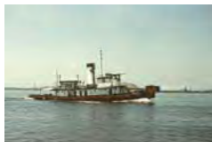
Delaware SL_01200 Quantity___