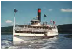
Ticonderoga (Lake Champlain) SL_04376 Quantity___