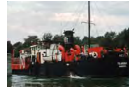
Transbay (of Montreal in canal) SL_07588 Quantity___