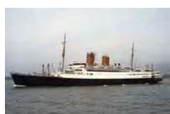
Berlin (North German Lloyd) NY Harbor SL_07363 Quantity___