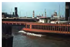
Hoboken & Elmira (Hoboken, NJ) SL_01057 Quantity___