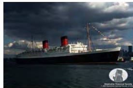
Queen Elizabeth (New York Harbor) SL_25229 Quantity___