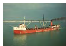
Kenora SL_01735 Quantity___