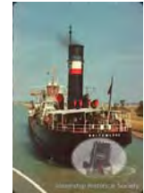
Britamlube (St. Lawrence canal) SL_01490 Quantity___