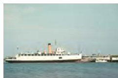
New Bedford & Pemaquid (Block Island ferries) SL_04456 Quantity___