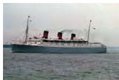
Queen of Bermuda (Furness Bermuda Line) NY Harbor SL_08878 Quantity___