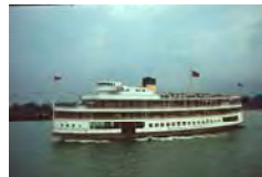
Ste. Claire (Detroit River) SL_01743 Quantity___