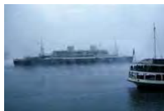
Batory (Polish Lines, Quebec City) SL_11908 Quantity___