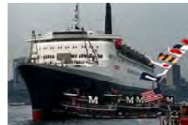
Queen Elizabeth 2 SL_25797 Quantity___