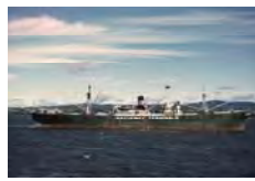
Saguenay Terminals (St. Lawrence River) SL_02823 Quantity___